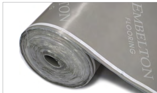
Hush Platinum – Peel-and-stick for easy installation