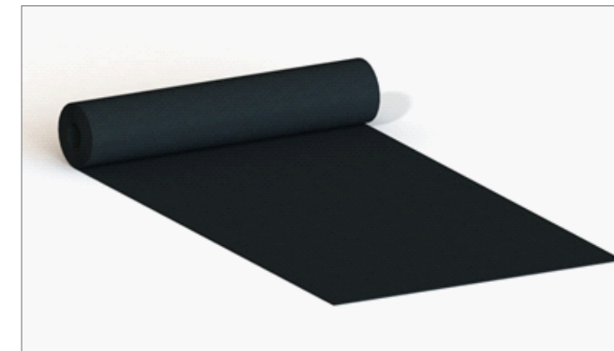
ImpactaMat Acoustic Rubber Underlay, 3mm or 5mm